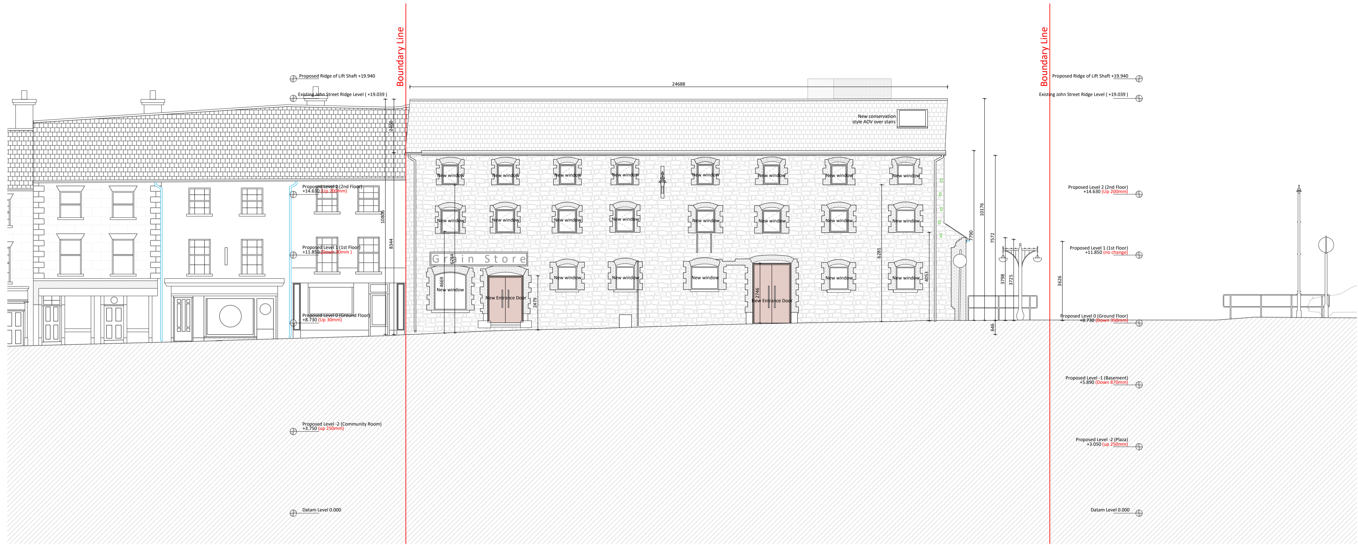
01 East (John Street) Elevation As Proposed Scale: 1:100